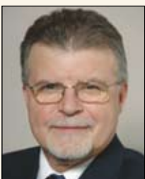
The Honourable Dennis Fentie Yukon Premier

Welcome to the Yukon First Nations Resource Opportunities Conference. Yukon government is pleased to be a patron sponsor of this event and we are looking forward to its success.